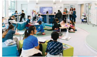
Classrooms to Studios