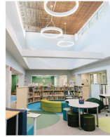
Hallway to Learning Commons